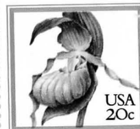
Yellow lady's slipper Cypripedium calceolus